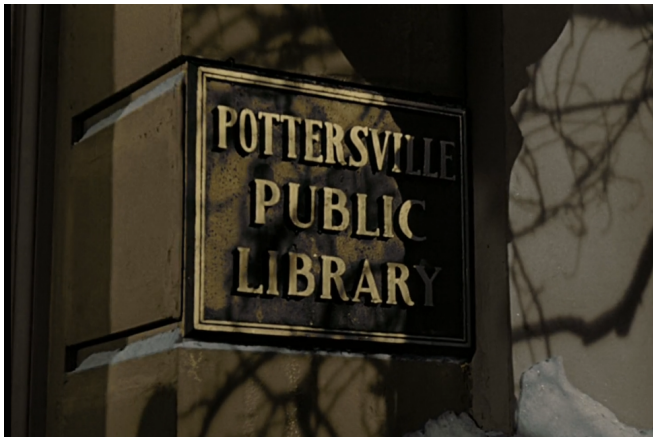
It's a Wonderful Life, 1946